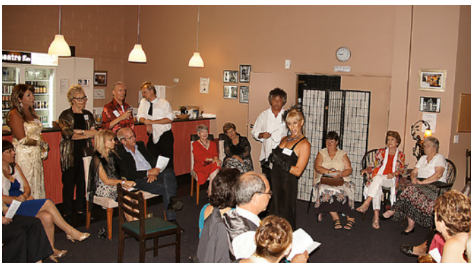
The Murder Night in full swing!