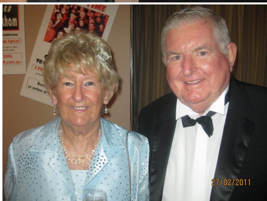
Dolphins guests: pictures courtesy of Les Karpathy